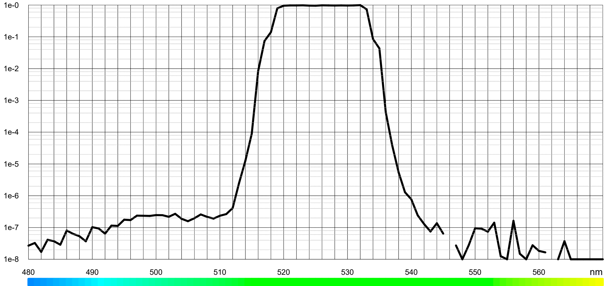
Typical transmission BP 526/14 (LF104541)